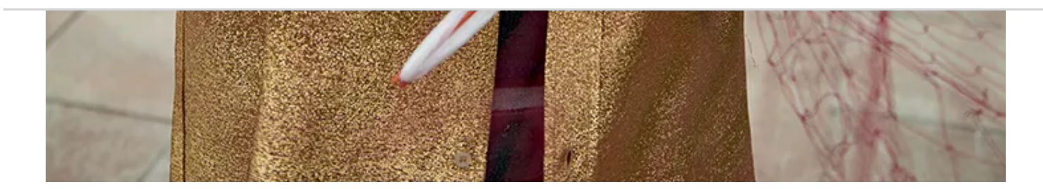
Above